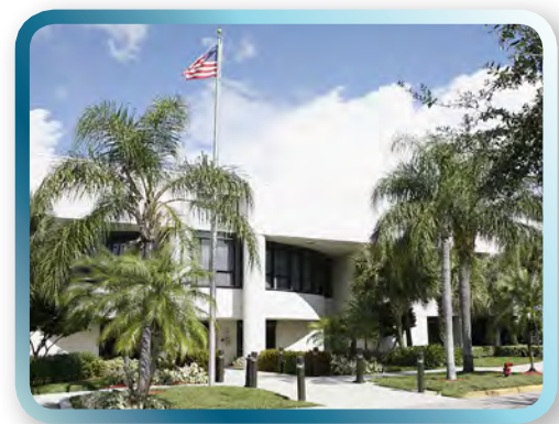
Charles W. Gerstenberg inpatient care center

Inpatient Care Centers – When a patient’s symptoms become unstable or the patient requires special treatments, we offer 24/7 acute care in our 9 inpatient care centers . Your donations enabled us to update and expand these facilities to provide care and comfort to the families who need them.