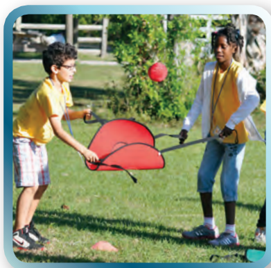
Camp Good Grief, an overnight camp for bereaved children