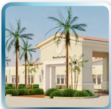
Boca Raton inpatient care center

Charitable Care – As your community hospice, we admit everyone who needs and wants our services, regardless of insurance or the ability to pay for care. Your support has made it possible for everyone to receive care at the end of life.