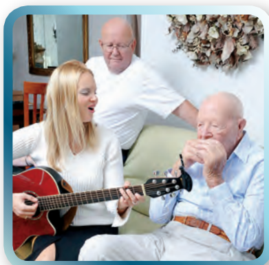
Music Therapy improves quality of life.