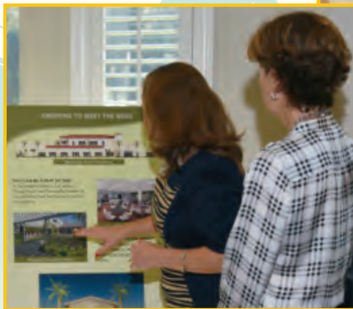
In 2015, our Boca Raton Care Center was beautifully renovated. The addition of a cafeteria and tranquility garden is scheduled next. Visitors to the Care Center get a glimpse of the proposed expansion plans.